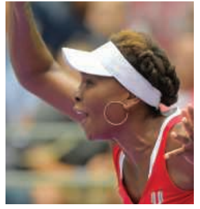
The fastest serves of all time belong to two players from the USA. Taylor Dent hit a 148mph serve in 2010, and Venus Williams holds the ladies record, serving at 129mph in 2008.