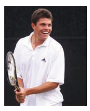
Wimbledon is one of the four Grand Slam tournaments, along with the US Open, the Australian Open and the French Open. It is the only major tournament still played on grass.

With 39,000 spectators in the Wimbledon grounds at any one point during the tournament these days, it's the largest single annual catering operation in Europe, requiring 3000 catering staff. Of course, Wimbledon is synonymous with strawberries and cream and over 166,000 portions are consumed over Wimbledon's two-week period. The strawberries are picked in Kent at 4am each morning, collected from the packing plant at 9am and delivered to Wimbledon by 11am to ensure the utmost freshness.